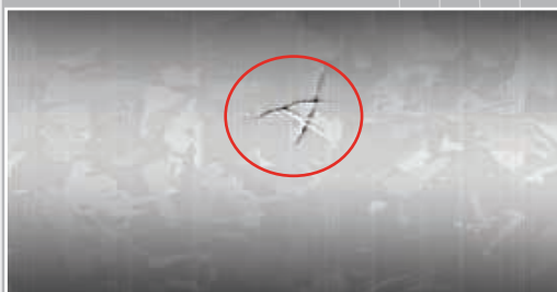
• Semiconductor inspection