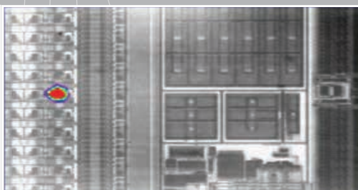
• Semiconductor inspection