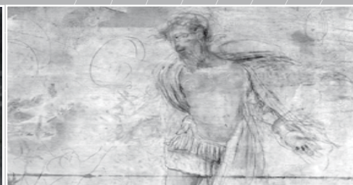
• Art inspection